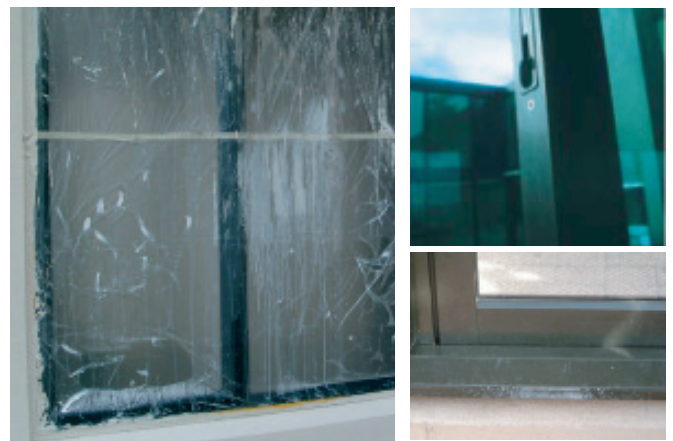
Three of these photographs display damage that has occurred on site, post installation. The photo of the masked joinery on the left displays clear signs of damage that could have occurred were it not masked. Please ensure that your joinery is protected right through the entire construction process.

All the activity on a construction site means that your window joinery or other powder coated items may get knocked or scratched, splattered with mortar, plaster, textured coating or paint during the later stages of construction. Please ensure that all powder coated articles are masked or covered at this time. It is far easier to prevent accidents than to try and correct them. Should your joinery receive mortar or paint splashes see that these are removed before cure and follow the instructions contained in this brochure.