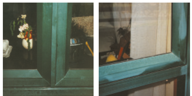
Examples of solvent misuse on aluminium joinery, showing deterioration of powder coating after 3 years.